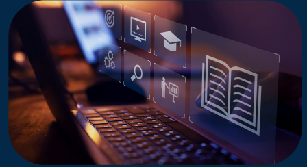
LIBRARY WITH E-RESOURCES